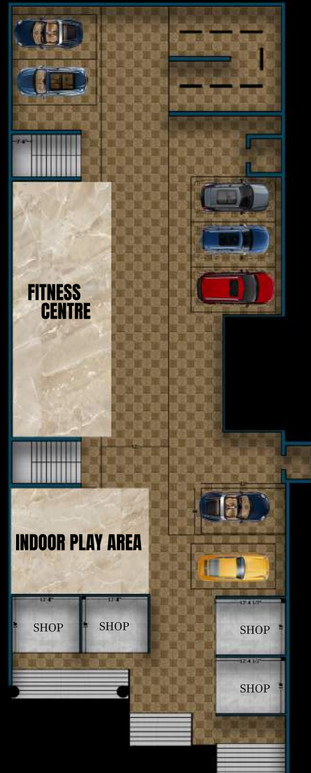
GROUND FLOOR 2D PLAN

Please note The Interiors, Furniture, Fittings, Fixtures, etc. shown in the image/drawing are only artist's conception and, not part of actual amenities provided. The actual amenities as mentioned in the agreement for Sale shall be final and provided in the flats.