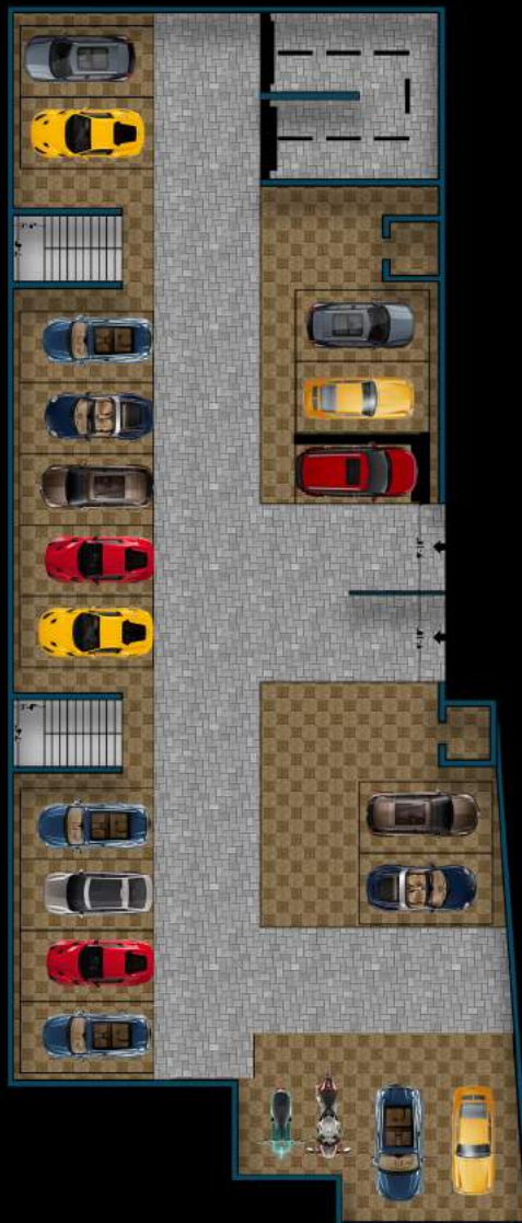
BASEMENT 2D FLOOR PLAN