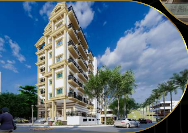
Satya Kallone Tower